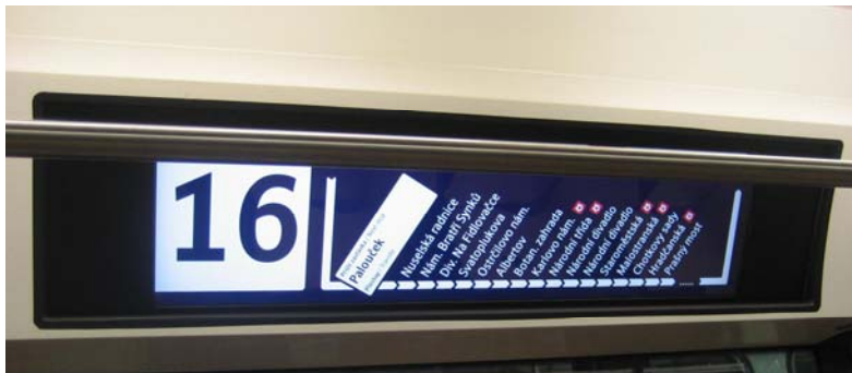
Application photo of Bustec LCD info screen signs