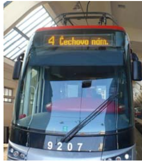
Application photo of Bustec LED destination signs